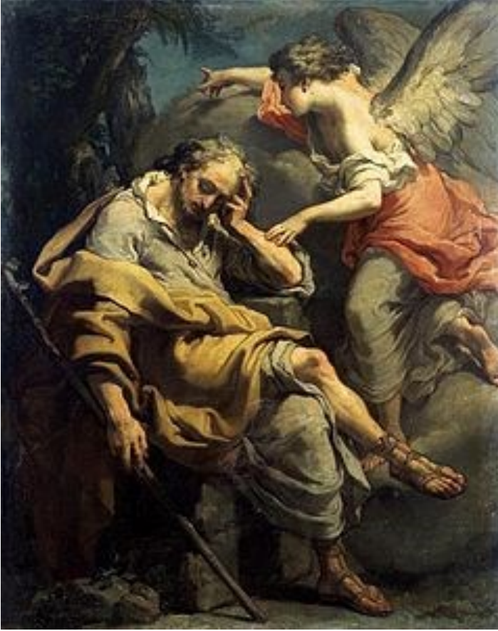
"Joseph's Dream" by Gaetano Gandolfi ( 1790)